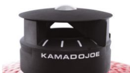
Kontrol Tower Top Vent