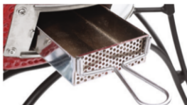
Slide-Out Ash Drawer