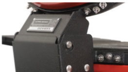
Air Lift Hinge